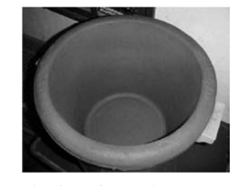
Fig. 2-b. Ceramic Water Purifiers (CWPs)